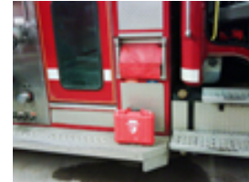
Ritchot Fire Department

To properly equip your facility, this AED also includes some of the following accessories: