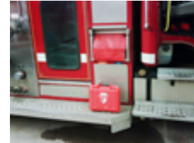
Ritchot Fire Department

To properly equip your facility, this AED also includes some of the following accessories: