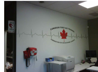
CANADIAN FIRST-AID TRAINING Ltd. !!!

To properly equip your facility, this AED also includes some of the following accessories: